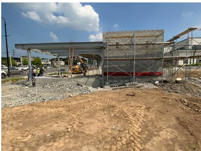
Climate-controlled waiting facility (looking north)