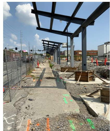
On-street canopies for bus boarding (looking north)