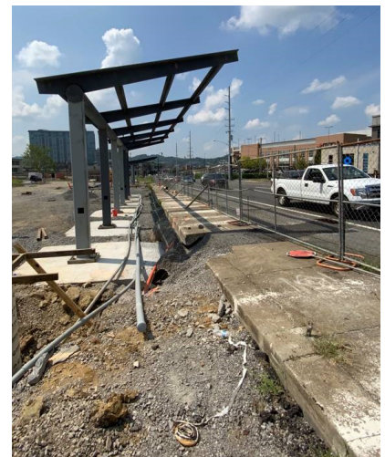
On-street canopies for bus boarding (looking south)